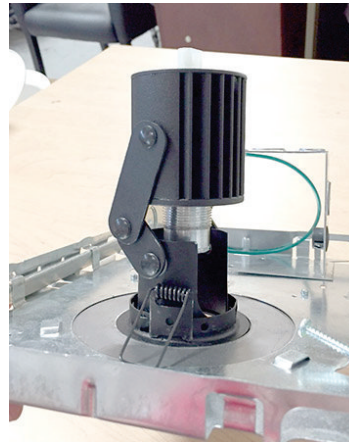
2 - Install fixture and make sure it is pointed straight down.