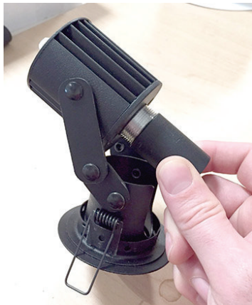
1 - Unscrew the snout.