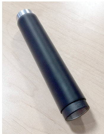
4 - Insert snout into unthreaded side of the adjustment tool