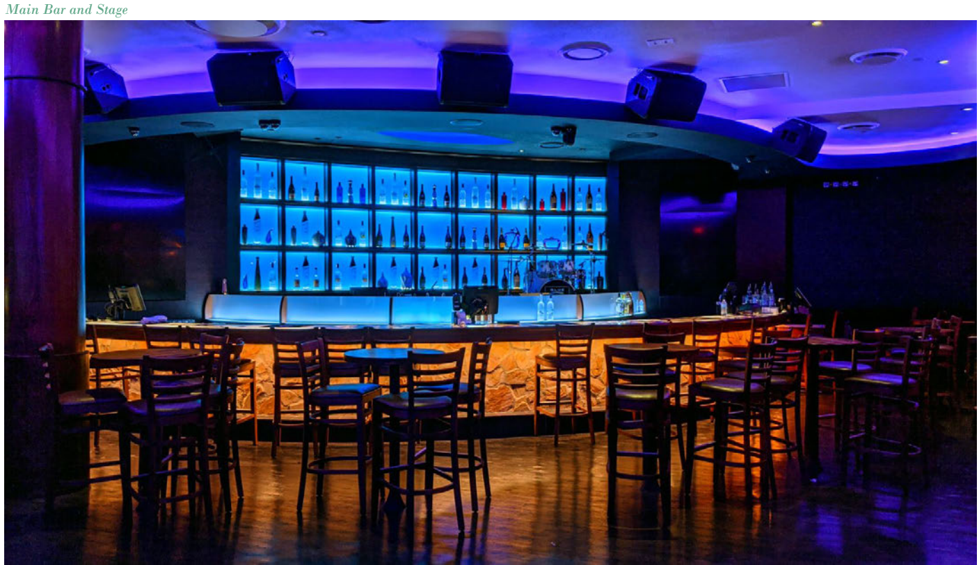
Blue Martini, Buckhead – Atlanta, GA

The 32-bit processor with 64,000 dimming steps in the Absolute Light allows seamless visual and acoustical integration of the 100,000+ watt sound system in the club with the 16.7 million color changing option from Clarté Lighting's Absolute Light to create a truly unique synchronized acoustical and visual experience in the space.