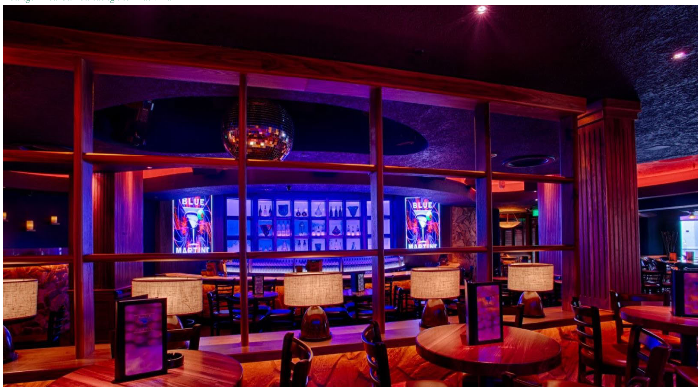
Blue Martini, Buckhead – Atlanta, GA

The dimming profile is also gamma corrected with 50% of the dimming range applied to the last 20% of the dimming profile to create greater granular control of light levels at the lowest levels down to .001% with no flicker or strobing, dimming perfection.