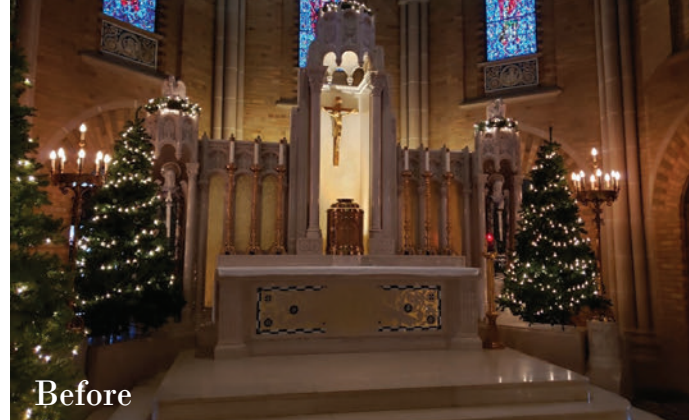
Before Clarté Fixture Installation