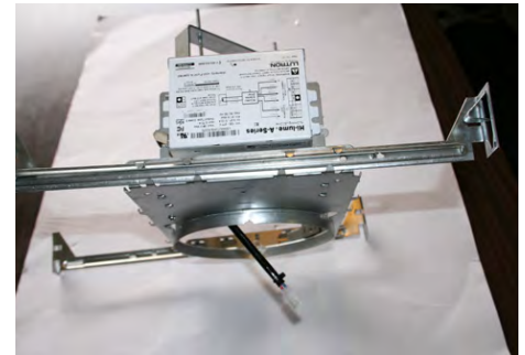
6. Pull Transformer Pig Tail through opening