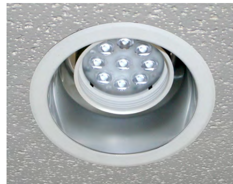
10. Restore electrical Power and check the operation of your new CLARTÉ light fixture.