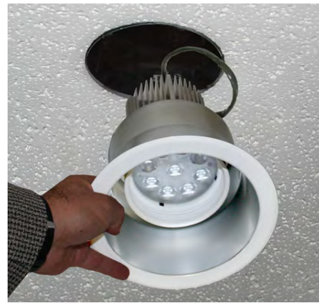
8. Push LED Fixture Assembly through opening.