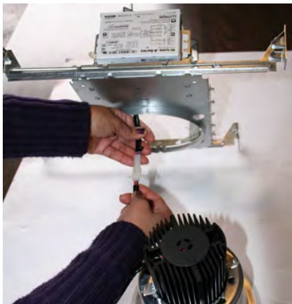
7. Plug in fixture pig Tail to Transformer Pig Tail