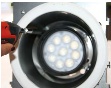
9. Attach the fixture to the bridge provided using the two screws.