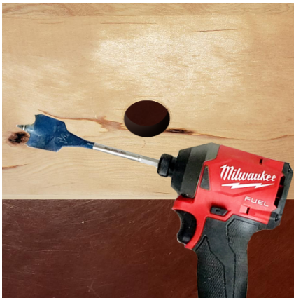
1. Drill a 3/4" hole into the wood.