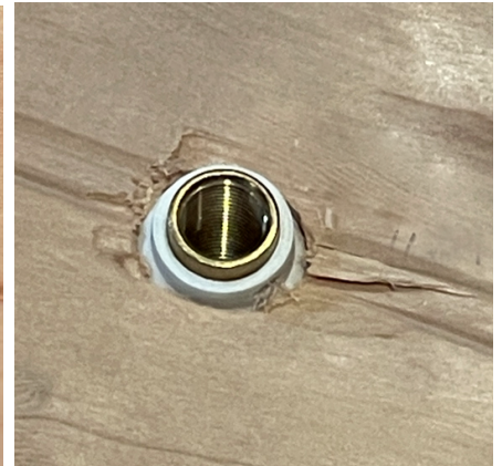
(View from behind)