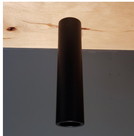
4. Screw fixture into place until plastic insert is not visible.