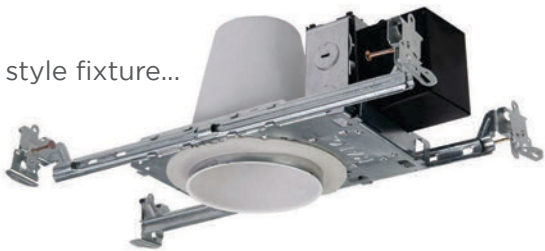
4" Straight/Round Sided Housing