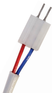
Clarté Retrofit Bipin Plug

Add RET to any 3" trim to specify Retrofit Version. Retrofit Version = bipin plug and LED driver inside Clarté PAR16 scale heat sink.