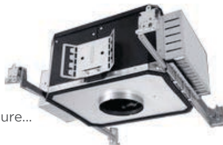
4" Architectural Square/Rectangle Housing