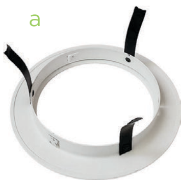
(tc) Tension Clips