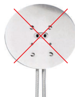
Remove Heat Deflection Plate