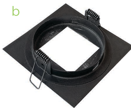
(sc) Spring Clips