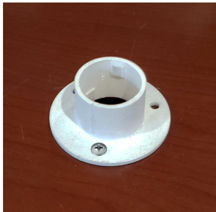
2. Center the plastic sleeve with the hole then mount to the back of the wood by drilling in 3 screws. Thickness of wood must be specified. (Can be recessed, flush, or semi-recessed)