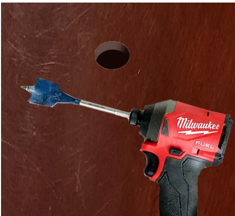
1. Drill a 1" hole into the wood.