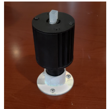
3. Insert fixture into sleeve from behind.