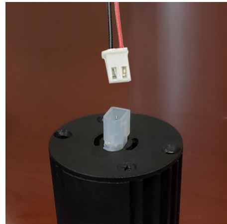
5. Connect wire to back of fixture.